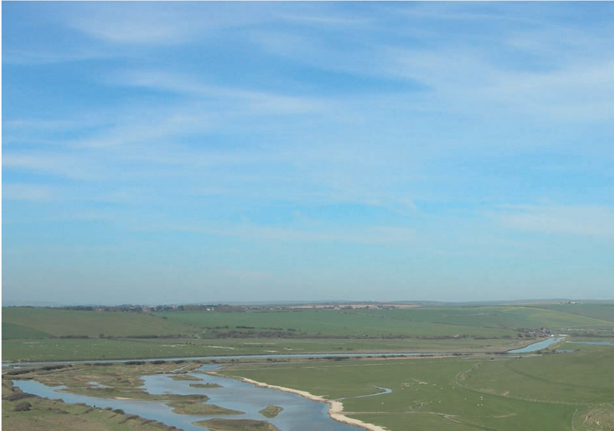
Photograph C for Question 3